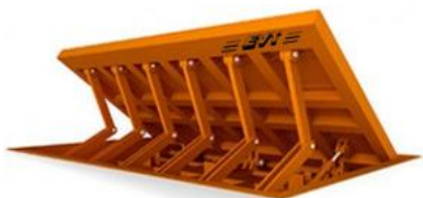
RAL1028 Melon Yellow EVT-SMHRB-28-x (x refers to the desired blocking width)