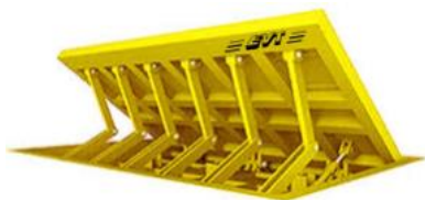
RAL1018 Zinc Yellow EVT-SMHRB-18-x (x refers to the desired blocking width)