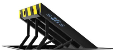
RAL9005 Black Striped RAL1018 Zinc Yellow EVT-SMHRB-58-x (x refers to the desired blocking width)

All rights reserved. Appearance and specifications are subject to change without prior notice